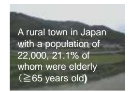
A rural town in Japan with a population of 22,000, 21.1% of whom were elderly (≥65 years old)

CMs and NCs have a good grasp of the everyday life of the elderly and are aware of the danger posed by elderly drivers, but are hesitant to tell them to stop. As well as some measures to ensure safe driving of the elderly they are hoping for public support to secure a comfortable life for the elderly after giving up driving. The NCs are hoping that the elderly themselves will be more aware of safe driving, that the elderly and their families will solve the problems and the communities will be more interested in the topic and offer help. These show the role awareness of the NCs, who are volunteers promoting the welfare of local communities.